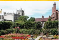
Where the Shakespeare story ended

Visit this delightful Jacobean house with its Elizabethan Knot Garden and remains of New Place, Shakespeare's final beloved home. View the Web of Life exhibition and listen to specialist talks on the dramatist's life, the imagery in his plays and the house's paintings. Outside visitors can admire the giant flower sculpture of Shakespeare's Coat of Arms and children are invited to dress up as Shakespearian characters for a photo opportunity under the famous Mulberry tree.