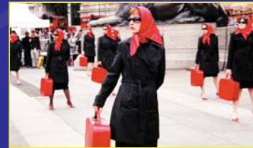
'Red Ladies' Clod Ensemble.

2009 is the 400 th anniversary of the publication of Shakespeare's Sonnets and we acknowledge this with a number of special events including RSC actors reading Sonnets on the ferry and a game for all the family to play called the Sonnet Sleuth .