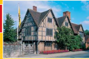
The Jacobean Doctor's House