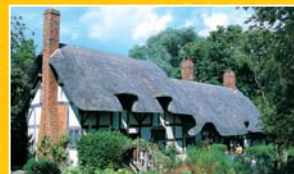
The most romantic Shakespeare House

Following the Easter Holiday theme of 'Growing Pains' Hall's Croft provides some grisly insights into being a Tudor Tot in its latest exhibition ' Gory and Ghastly '. Children can discover the perilous path of childhood in the 16th and 17th centuries through a range of fun activities.