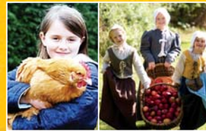
A real working Tudor farm